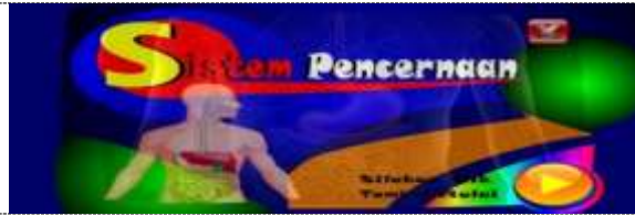
Figure 2. Front view of interactive multimedia learning media.