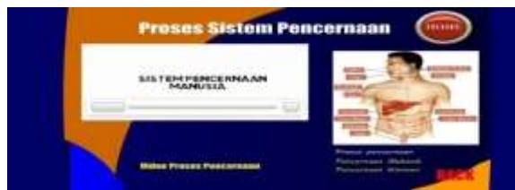
Figure 4. Display Learning Materials