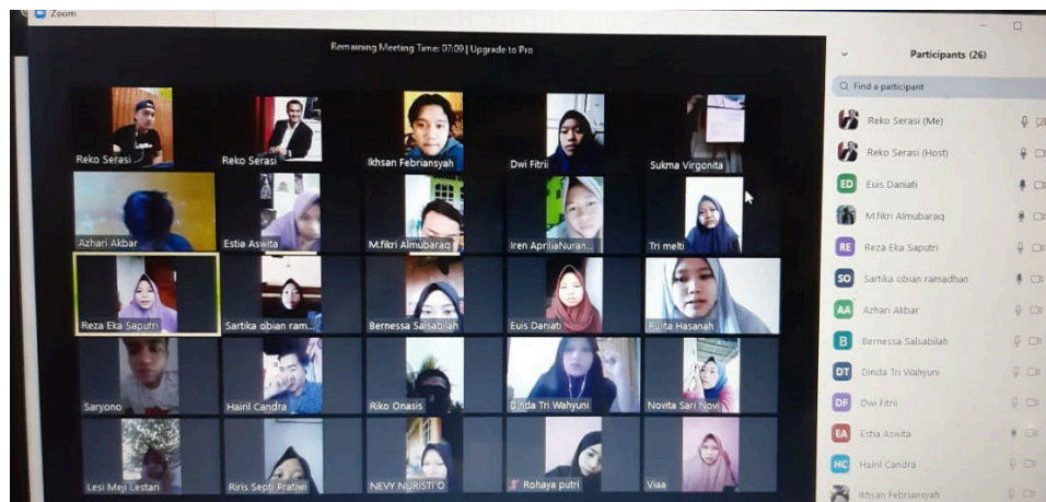
Figure 2. Product Trial Process in Zoom meetings software

To find out the application of teaching module that have been developed, researchers need to test the product in the field by involving students in the teaching and learning process. The purpose of this step is to obtain information and feedback related to the effectiveness of the teaching module that have been developed and so from the feedback, the researchers will get criticism and suggestions that can be used to rectify and improve the quality [7]. This stage is also compatible with the step model of ASSURE development research that requires Learners participation [6]. Therefore, the researchers tested this development teaching module on thirty students of English education at one of the universities in Indonesia who were undergoing Cross Cultural Understanding subject online through the application of ZOOM which had been several times used by lecturer in the teaching and learning process during this Covid-19 pandemic.