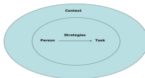
Figure 1 Person-Task-Context-Strategies (Gu & Johnson, 1996)

Considerably more research has been conducted to define language learning strategies (LLS). For example, as seen in his explanatory model (Figure 1), Gu and Jhonson in Ng, Azizie, and Chew (2021) have gone deeper into a task's perspective in defining LLS. To complete a language task, a person needs to use strategies so that the learning can be much easier. Also, it could be seen that strategies used by a learner could be determined by the context, which means that different learning contexts may result in different strategies being used to complete the same task. For example, beginner and advanced students may use different approaches in knowing and remembering the words to understand collocations in vocabulary. Hence, no matter the task, it is acceptable for the learners to use whatever types of language strategies they find most interesting and useful. It can be seen in Figure 1.